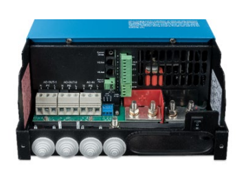
Connection area 12/3000/120-50

Operational data can be stored and displayed on our VRM (Victron Remote Management) website, free of charge. When connected to the internet, systems can be accessed remotely, and settings can be changed.